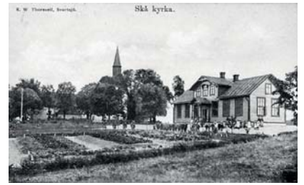
Skolträdgården = skolgården, Skå folkskola, Ekerö, 1901

SLU Swedish University of Agricultural Sciences (*Swedens longest university*)