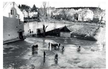
går på skolgården inför högstuflikonkurrensen.