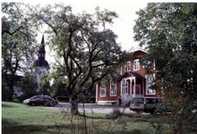
Skå folkskola, 2003